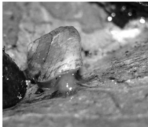
FIGURE 3. Photographs of species formerly believed to be extinct: (A) Hirasea acutissima , (B) Ogasawarana yoshiwarana .