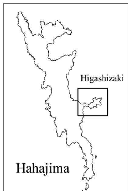
FIGURE 1. A map of the Higashizaki Peninsula on Hahajima Island in the Ogasawara Islands, showing the locations of the study sites.